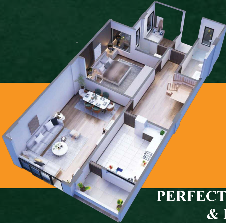
LOWER GROUND DUPLEX