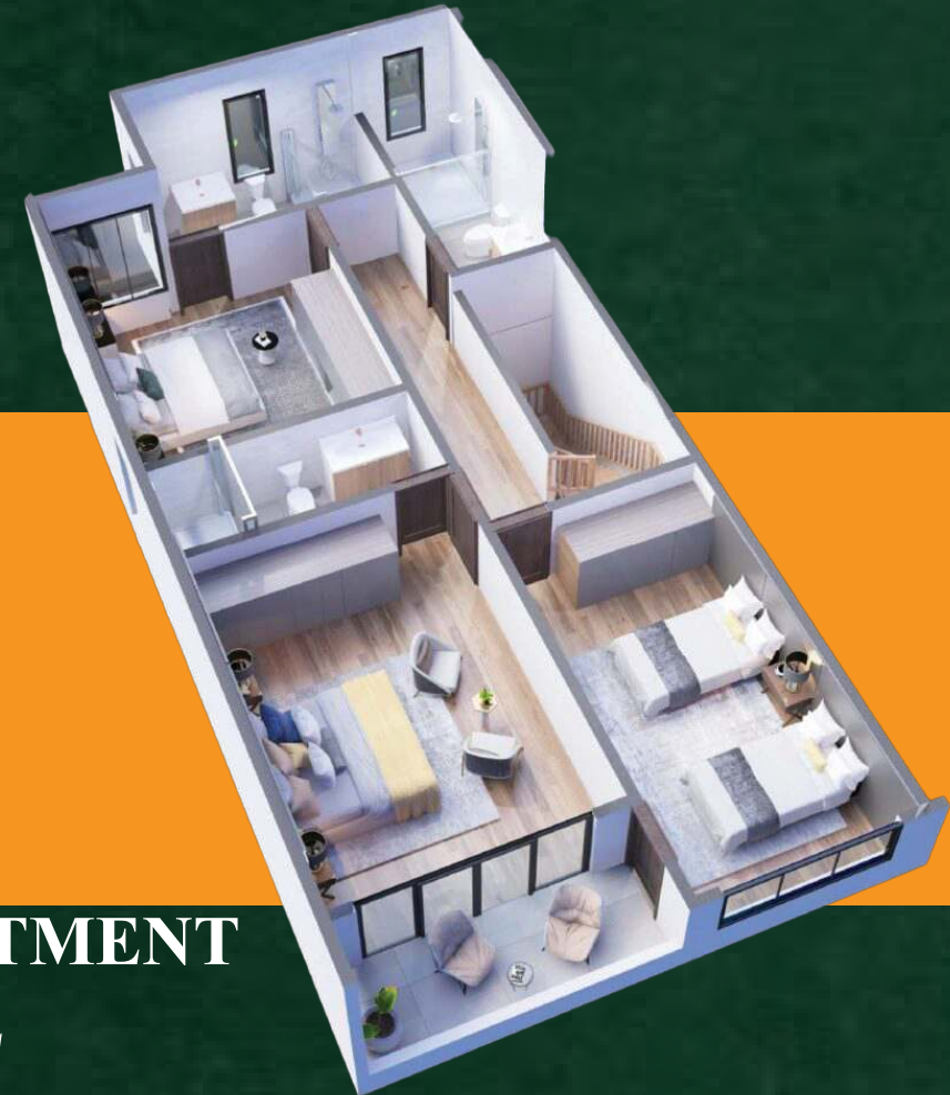
UPPER GROUND DUPLEX