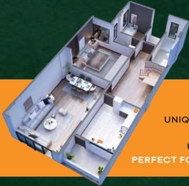
LOWER GROUND DUPLEX